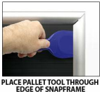
PLACE PALLET TOOL THROUGH EDGE OF SNAPFRAME