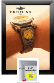
27x40 FRAME (PICTURES SHOWN, NOT TO SCALE)

FOR CURRENT PRICING, VISIT THE ID # LISTED ABOVE FREE SHIPPING