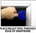
PLACE PALLET TOOL THROUGH EDGE OF SNAPFRAME