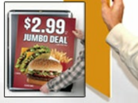
SECURITY TOOL PROVIDED