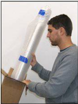
Sizes 24" x 36" and larger ship Unassembled