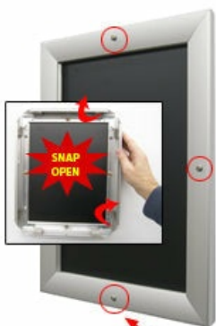
Lockable security screws placed on all 4 sides