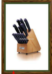
1" VIEWABLE MATBOARD

FOR CURRENT PRICING, VISIT THE ID # LISTED ABOVE