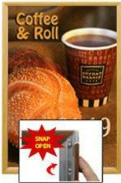
1 5/8" WIDE PROFILE