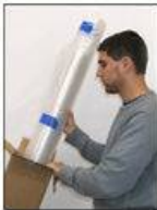
ALL FRAMES SHIPPED UNASSEMBLED SIMPLE & EASY ASSEMBLY