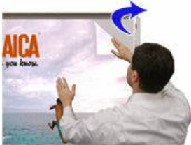
THIN POSTER INSERTS