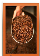
2" VIEWABLE MATBOARD