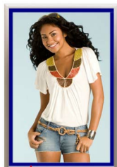
1" VIEWABLE MATBOARD