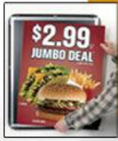
SECURITY TOOL PROVIDED