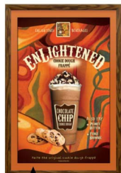
2" VIEWABLE MATBOARD