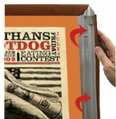
ALL FOUR SIDES SNAP OPEN