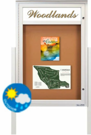
13+ Sizes - Portrait & Landscape

Please type your message in the text box provided below, we will try to keep your message on one line unless otherwise specified. If we can't fit your message on one line we will center your copy on two lines. For the customer that needs a specific font, color or text