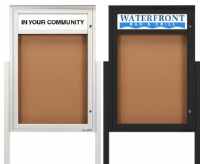
Full Color Artwork (Additional Charge)