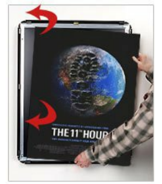
FRONT LOADING - FAST CHANGE OF POSTERS AND SIGNAGE

**Poster Snap Frames are weather resistant...not water-proof