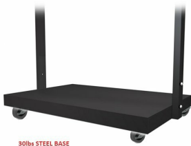
30lbs STEEL BASE