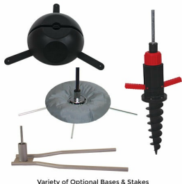
Variety of Optional Bases & Stakes