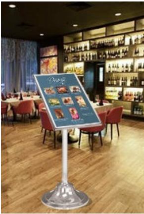
Weighted base holds up in high traffic areas