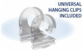
UNIVERSAL HANGING CLIPS INCLUDED