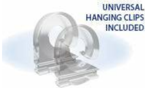
UNIVERSAL HANGING CLIPS INCLUDED