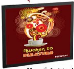
Magnetic footstand on back of frame sticks to steel surfaces