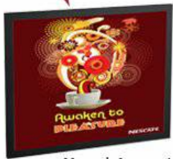
Magnetic footstand on back of frame sticks to steel surfaces