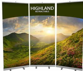
Set of Three (3) 31 1/2" W x 78 1/2" H Banner Stands Total Graphic Area of Approx. 97 1/2" W x 78 1/2" H