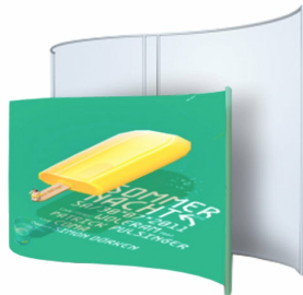
INTERLOCKING TUBES WITH SPRING BUTTON RELEASE, QUICK AND EASY ASSEMBLY

WHEN ORDERING BELOW, SELECT THE DROP DOWN MENU NAMED BANNER PRINTING TO CHOOSE IF YOU WANT A BANNER PRINTED.