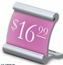
MOUNTED BASES COME IN SILVER & BLACK FINISHES