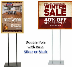
Double Pole with Base Silver or Black