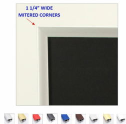
9 FRAME FINISHES AVAILABLE