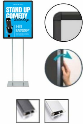
Sleek with Safety Radius Corners