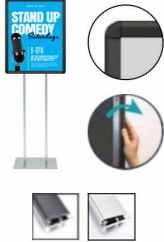
Sleek with Safety Radius Corners