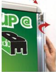
Sturdy Metal Square Base 12" x 16" Steel Plate BASE & POLES: SILVER or BLACK