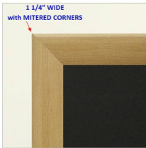
3 WOOD FAUX FRAME FINISHES AVAILABLE