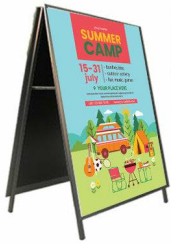
Security Screws Included