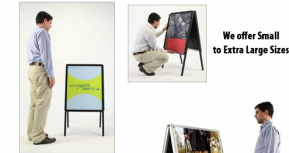
We offer Small to Extra Large Sizes