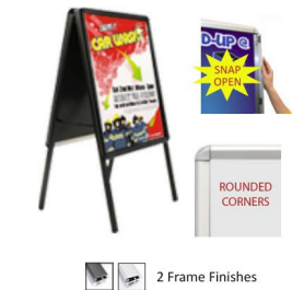
2 Frame Finishes