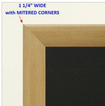
3 WOOD FAUX FRAME FINISHES AVAILABLE