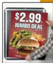
SECURITY TOOL PROVIDED