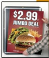
SECURITY TOOL PROVIDED