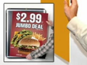
SECURITY TOOL PROVIDED