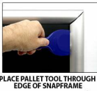
PLACE PALLET TOOL THROUGH EDGE OF SNAPFRAME