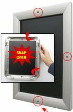
Lockable security screws placed on all 4 sides