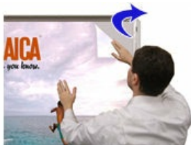
THIN POSTER INSERTS