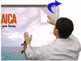
THIN POSTER INSERTS