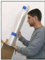
ALL FRAMES SHIPPED UNASSEMBLED SIMPLE & EASY ASSEMBLY