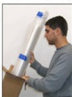
ALL FRAMES SHIPPED UNASSEMBLED SIMPLE & EASY ASSEMBLY