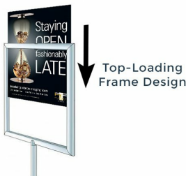
Top-Loading Frame Design