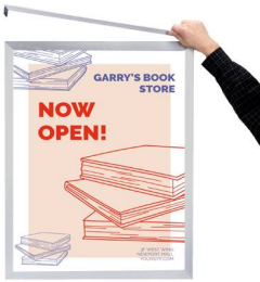
3/4" SLIM DESIGN