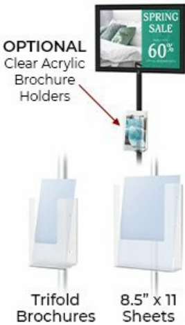
OPTIONAL Clear Acrylic Brochure Holders

OPTION 2: Will fit a Standard 8.5x11 Paper Size 9" Wide x 2" Deep