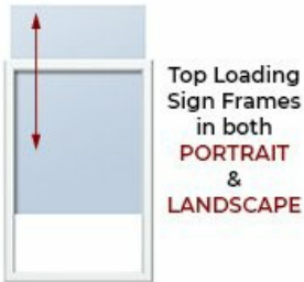
Top Loading Sign Frames in both PORTRAIT & LANDSCAPE