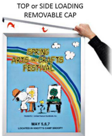
3/4" SLIM DESIGN

FOR CURRENT PRICING, VISIT THE ID # LISTED ABOVE FREE SHIPPING