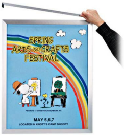
3/4" SLIM DESIGN

FOR CURRENT PRICING, VISIT THE ID # LISTED ABOVE FREE SHIPPING