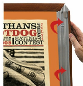
ALL FOUR SIDES SNAP OPEN