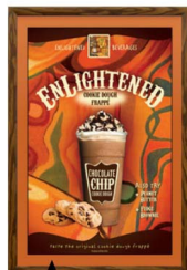
2" VIEWABLE MATBOARD