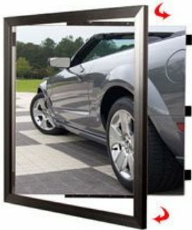
EASY POSTER CHANGES