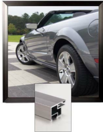
SWING OPEN & SWING CLOSE

FOR CURRENT PRICING, VISIT THE ID # LISTED ABOVE