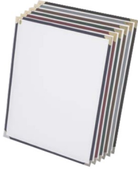
5 BINDING COLORS AVAILABLE

FOR CURRENT PRICING, VISIT THE ID # LISTED ABOVE