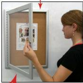
Frame Swings Open- Security Cam Lock On Front