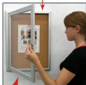
Frame Swings Open- Security Cam Lock On Front