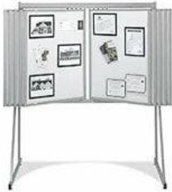
WHITE MATBOARD PANEL DIVIDER WITH LIGHT GRAY FINISH