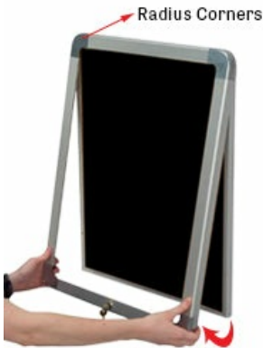
Once frame unlocks, lift up/off to easily access letter board panel