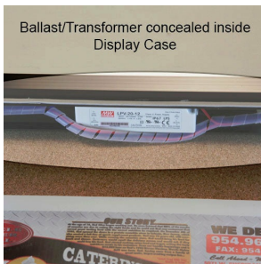
Ballast/Transformer concealed inside Display Case

For this option we place an LED strip light along the entire Perimeter of the interior display case. The light will shine from all 4 sides of the interior case, bringing more light intensity to the contents being displayed inside.