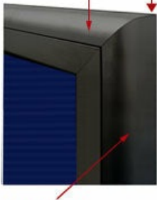
RADIUS EDGES on ALL 4 Sides Sleek and Contemporary Design